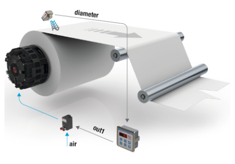
Regulation in torque with diametral sensor (open-loop)